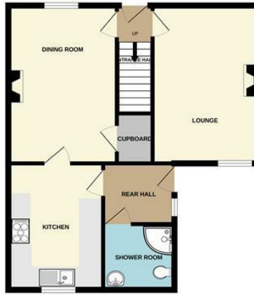
1ST FLOOR 559 sq.ft. (51.9 sq.m.) approx.